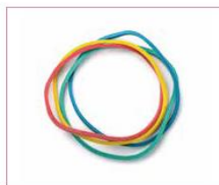
2. elastic band