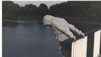
Teenagers who chose to commit suicide by throwing themselves into the river.

According to the second person we asked, she thought the possible factors that lead to youth suicide in today's Taiwanese society are stress, peer relationship, some mental diseases. In the school aspect, she considered it should strengthen the counseling mechanism to prevent suicide on campus. In the individuals aspect, she thought we should ask for others help more often when we couldn't channel our negative emotions, such as talking to people we trust.