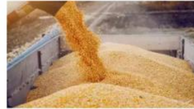
Russia's invasion of Ukraine and subsequent sanctions imposed on its economy have exacerbated global food prices.