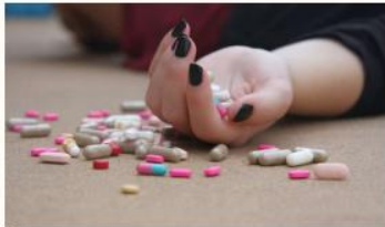
Teens who choose drug suicide.

The line Chart reveals that the suicide mortality rate generally shows an increase year by year.