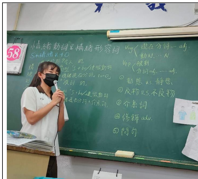
The students was introducing the adjectives describing moods and emotions.

I can design some comprehensive questions to make sure whether students have followed up and are able to understand the contents. Or I can even bring up some questions for them to ponder over the messages behind the story.