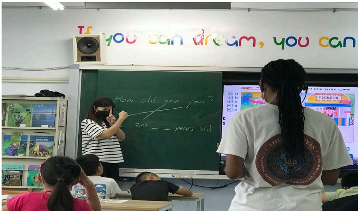
Teaching activities : How old are you? I am ___ years old.