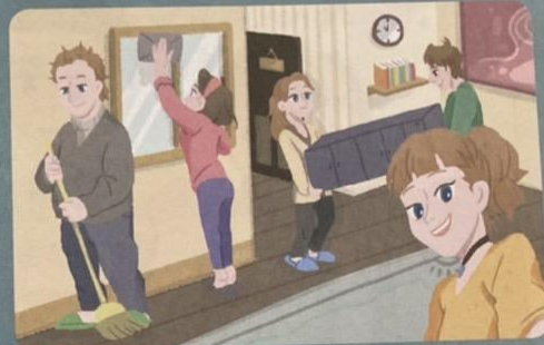
clean the house