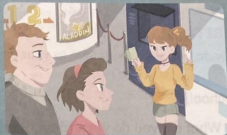
go to a movie