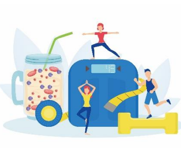
5. Victoria skips breakfast, counts her calorie intake, and exercises regularly in order to _______a healthy weight.