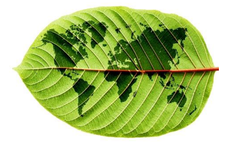
1. Besides generating profits, many companies worldwide are concerned about the planet and aim to promote _________ development.