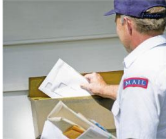
② mail carrier