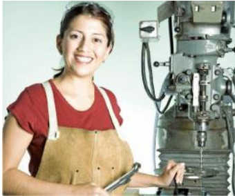
④ factory worker